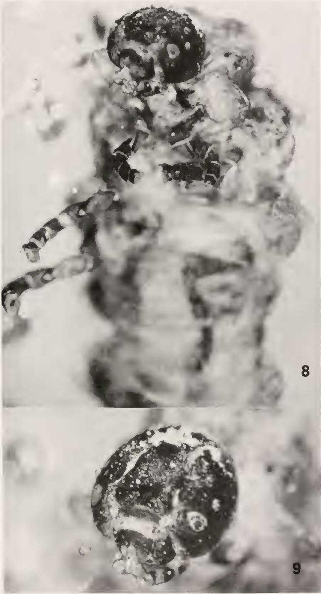
Figs. 8, 9. Argidae larva. 8, Ventral view of head and thorax. 9, Head.